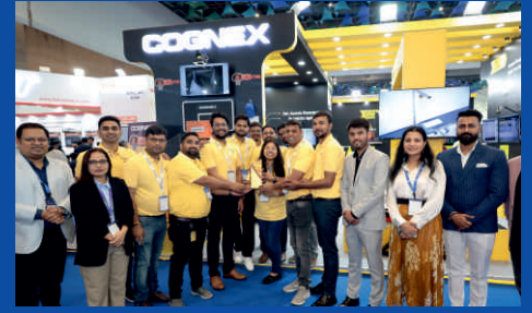
Digital Champion - Cognex