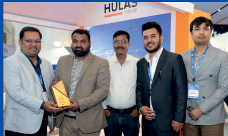
Special Recognition - Delmon Solutions, Stackbox, Hulas Infra