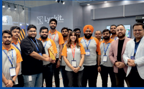
Best Sustainable Booth - Lynkit