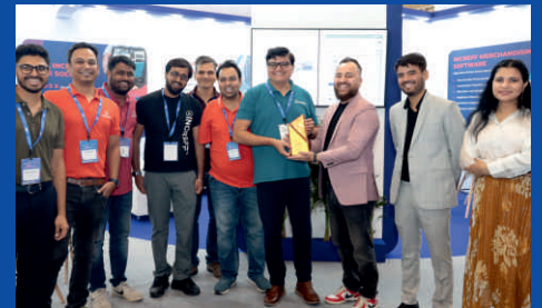
Jury Choice - Falcon Autotech, Increff