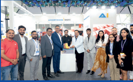
Best Booth Design - Armstrong Dematic

A prestigious lineup of awards recognizing excellence and innovation, including: