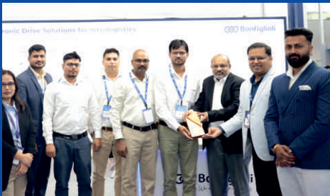
Best Debutant - Bonfiglioli